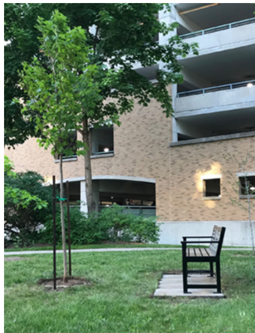
One Bench One Tree at Sunnybrook