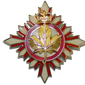
Vice-regal badge of the Lieutenant Governor

Thank you for being part of this work as we move forward with hope and confidence in the year ahead.