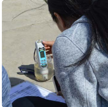
2024 Toronto Envirothon