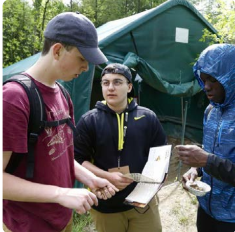
2017 Provincial Envirothon

Learn more about Ontario Envirothon at forestsCanada.ca/en/program/ontario-envirothon